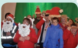
Santa Stroll & Christmas Fair: Page 2 & 3