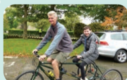
National Fitness Day: Page 5