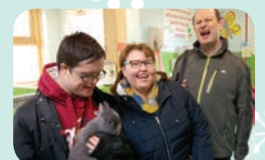
News from our Social Enterprises: Page 10 - 12