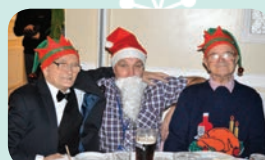
Christmas Party: Page 6 & 7