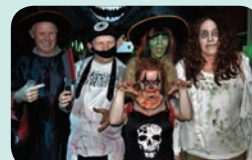
Voice for All's Halloween Party: Page 8