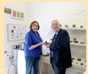
News from our Social Enterprises: Page 12 - 16