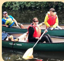
Canoeing Day Out: Page 6