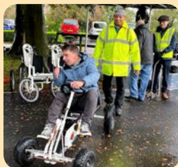
Health & Wellbeing Day: Page 4 & 5