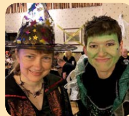
Voice for All Update: Page 8 - 11