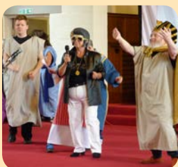
Heritage Day 2019 Continued: Page 2 & 3