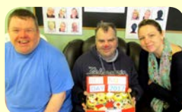
Bake Off for Comic Relief - Page 4