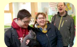
SelectionBOCS - Page 7