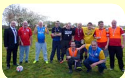
Health and Wellbeing Day 2017 - Page 3