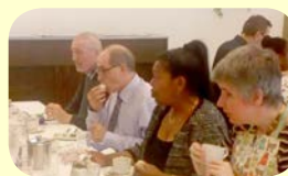
Pastoral Group Update - Page 5