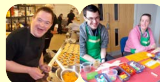
News from our Social Enterprises - Page 6