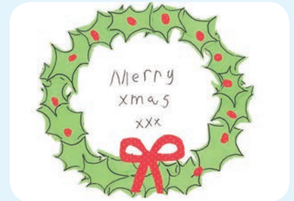
Runners-up Christmas Card Entries