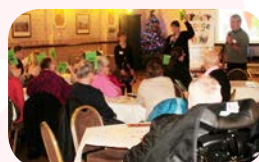
Voice for All AGM Celebration - Page 5