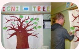
Digni-tea for Dignity Action Day - Page 2