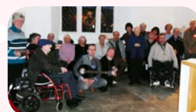
Pastoral Group Trip to Whalley Abbey - Page 6