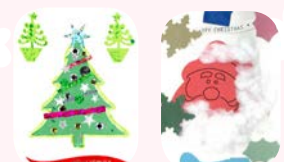
Christmas Card Competition 2016 Winner - Page 8