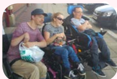
SelectionBOCS Days Out - Page 3