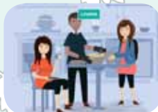
New Website Launch - Page 3