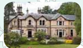
Pastoral Group Trip to Foxhill Retreat - Page 6