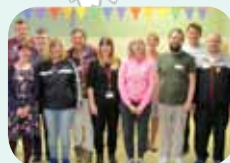
Voice for All Facebook Training Day - Page 4