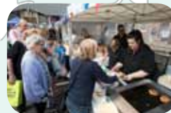
Roccoco at 'A Taste of Leyland' - Page 5