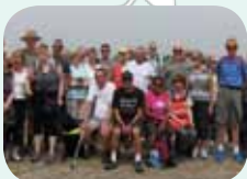
National Volunteer's Week Walk - Page 2